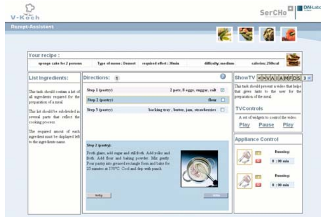
Figure 2: Example of the virtual cook user interface loaded into the runtime environment.

Our runtime system loads the complete task tree including all annotations into our task tree interpreter. The interpreter then identifies the initial ETS and utilizes our include mechanism to assemble the final user interface (see figure 2). In difference to already existing approaches like [Mo06][Pa02] we do not distinguish between a tool and the final runtime environment of the application. Each modification directly effects the resulting application. This WYSIWYG approach allows all involved parties (user interface designers, user interface developers, usability experts and service developers) to work simultaneously as soon as a first sketch of a task tree has been realized. Each developer can work independently according to the process we have described, but the centralized web-based development tool allows the coordination of the different work packages and promotes the exchange of feedback, based on a commonly understood and available prototype. Every person involved in the user development process can instantly check the effects of any modification on the whole application. This system features an integrated development process as well as the delivery of user interfaces based on a task model.